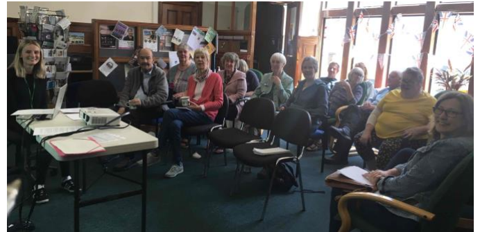
Thanking our volunteers

There will also be a Trussell Trust course on the Benefits system and Wiltshire Money Course on PIP applications.